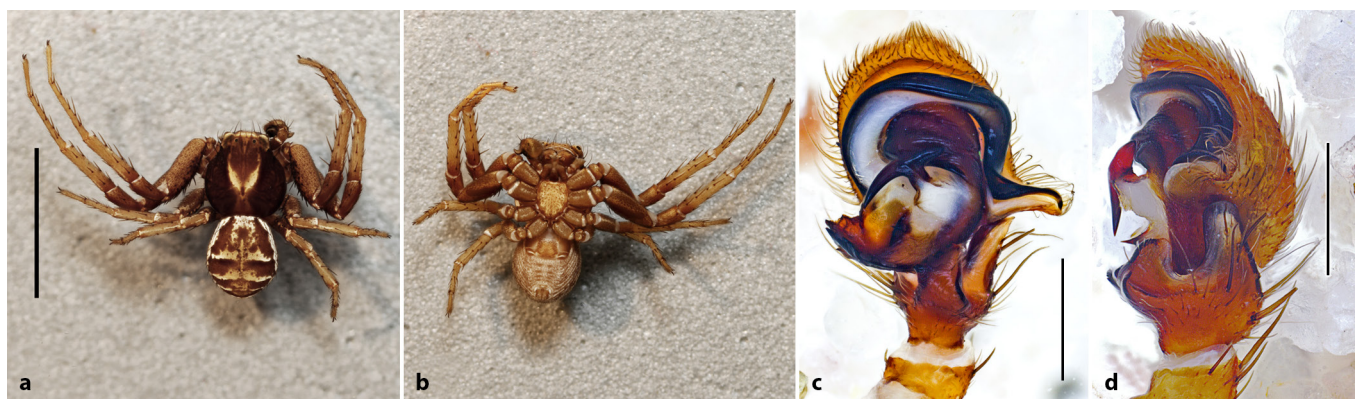
Fig. 2: Xysticus brevidentatus , male from Bosnia and Herzegovina. a. habitus dorsal view; b. habitus ventral view; c. pedipalp ventral view; d. pedipalp retrolateral view; scales: a, b = 5 mm, c, d = 0.5 mm

Based on the distribution reported in the literature, an occurrence of X. brevidentatus in Bosnia and Herzegovina was